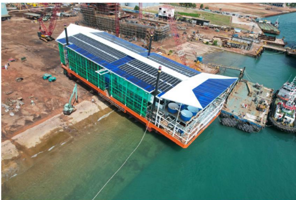
Figure 3B: Photo of the Vessel with three spud legs