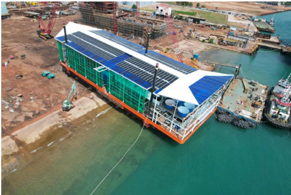
Figure 3B: Photo of the Vessel with three spud legs