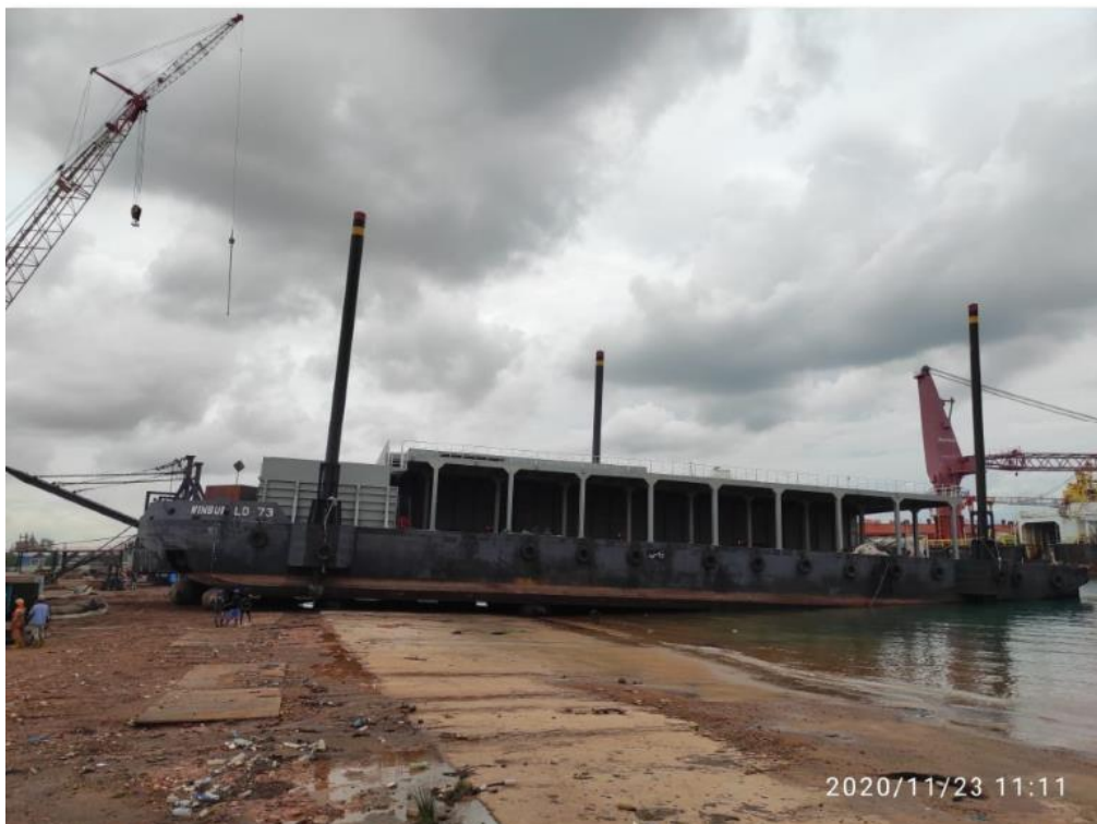
Figure 3A: Photo of the “WINBUILD 73” with three spud legs

93 From the photographs of the “ECO SPARK’s” launch and towing, 30 as well as the photographs of the barge “WINBUILD 73” prior to conversion, 31 it appears that the “Special Service Floating Fish Farm” was, in essence, built on top of the existing structure of the barge “WINBUILD 73”. Notably, the three spud legs were a consistent feature in the Vessel, present in both the “WINBUILD 73” and the Vessel (see Figure 3A and Figure 3B below). For all intents and purposes, the basic design and structure of the “WINBUILD 73” remained unchanged, and the defendant does not suggest that it was.